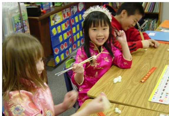
I can use chopsticks 学用筷子